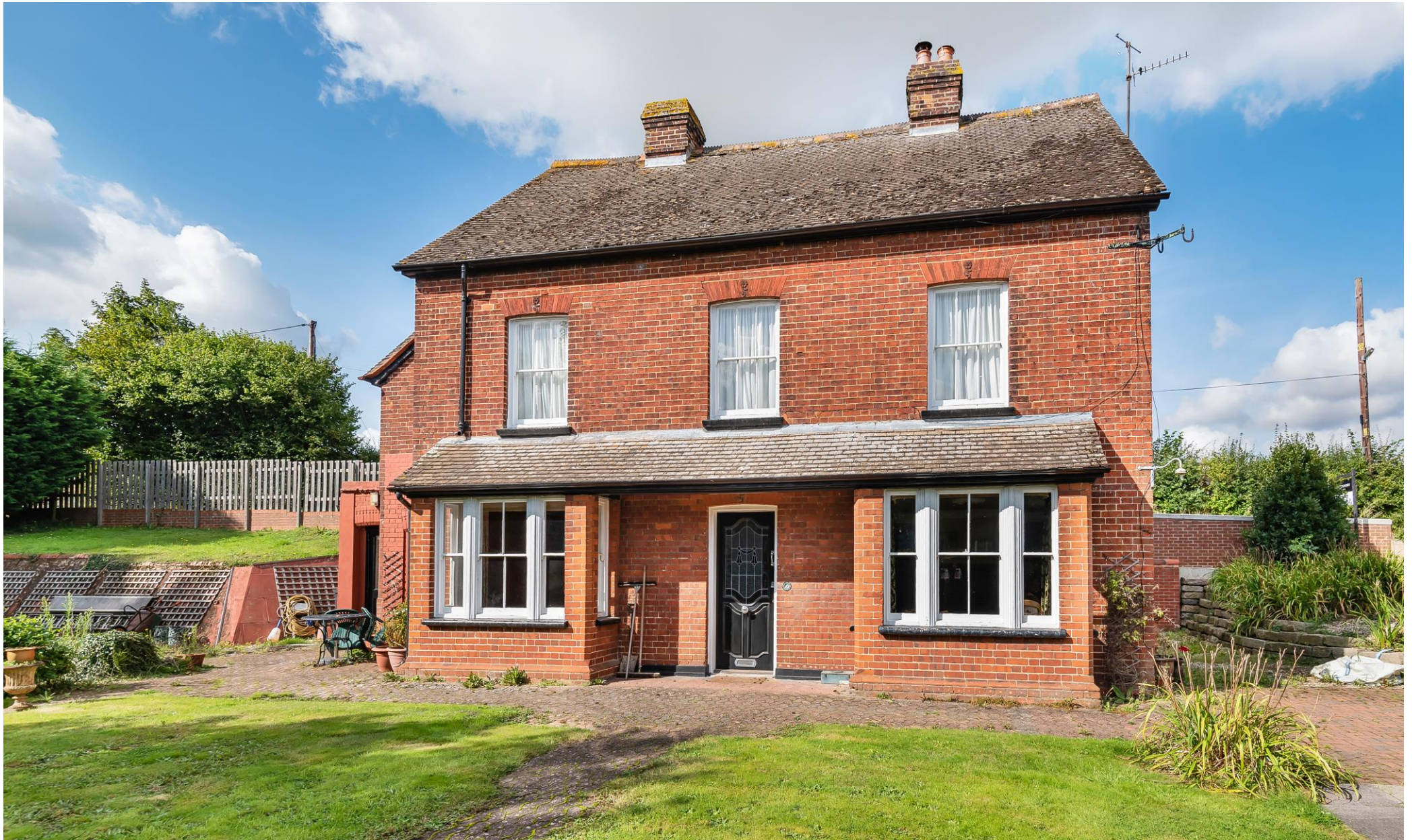
Tortoise House , Wethersfield Road, Sible Hedingham, CO9 3LA