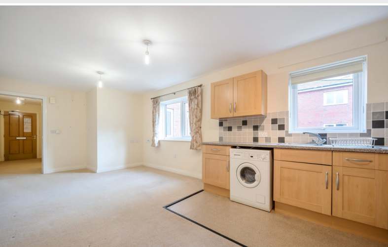
Living Room/Dining Kitchen