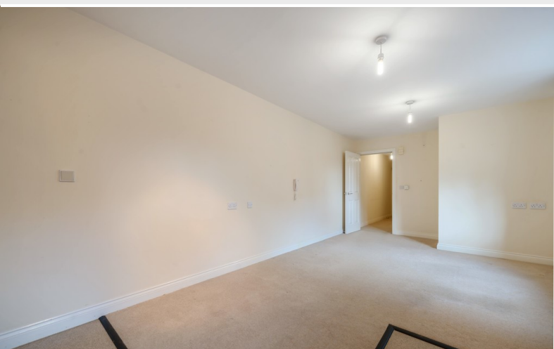
Living Room/Dining Kitchen

A modern self-contained lift serviced two bedroom retirement apartment located within a purpose built complex close to Penrith town centre and benefitting from a range of residents' communal facilities and available personal care packages.