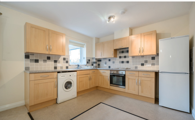
Living Room/Dining Kitchen