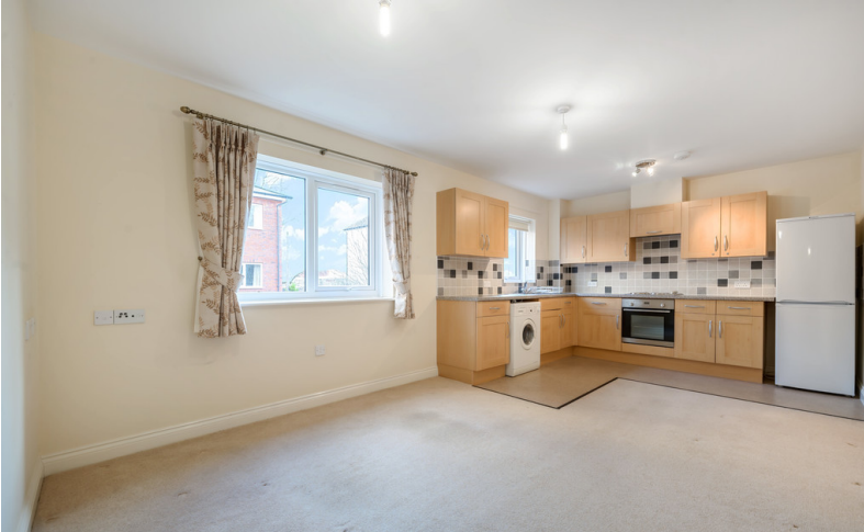
Living Room/Dining Kitchen