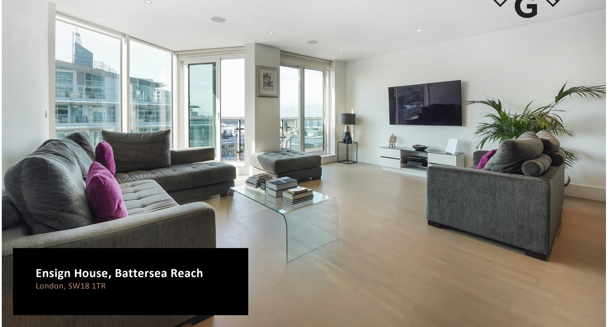
Ensign House, Battersea Reach London, SW18 1TR