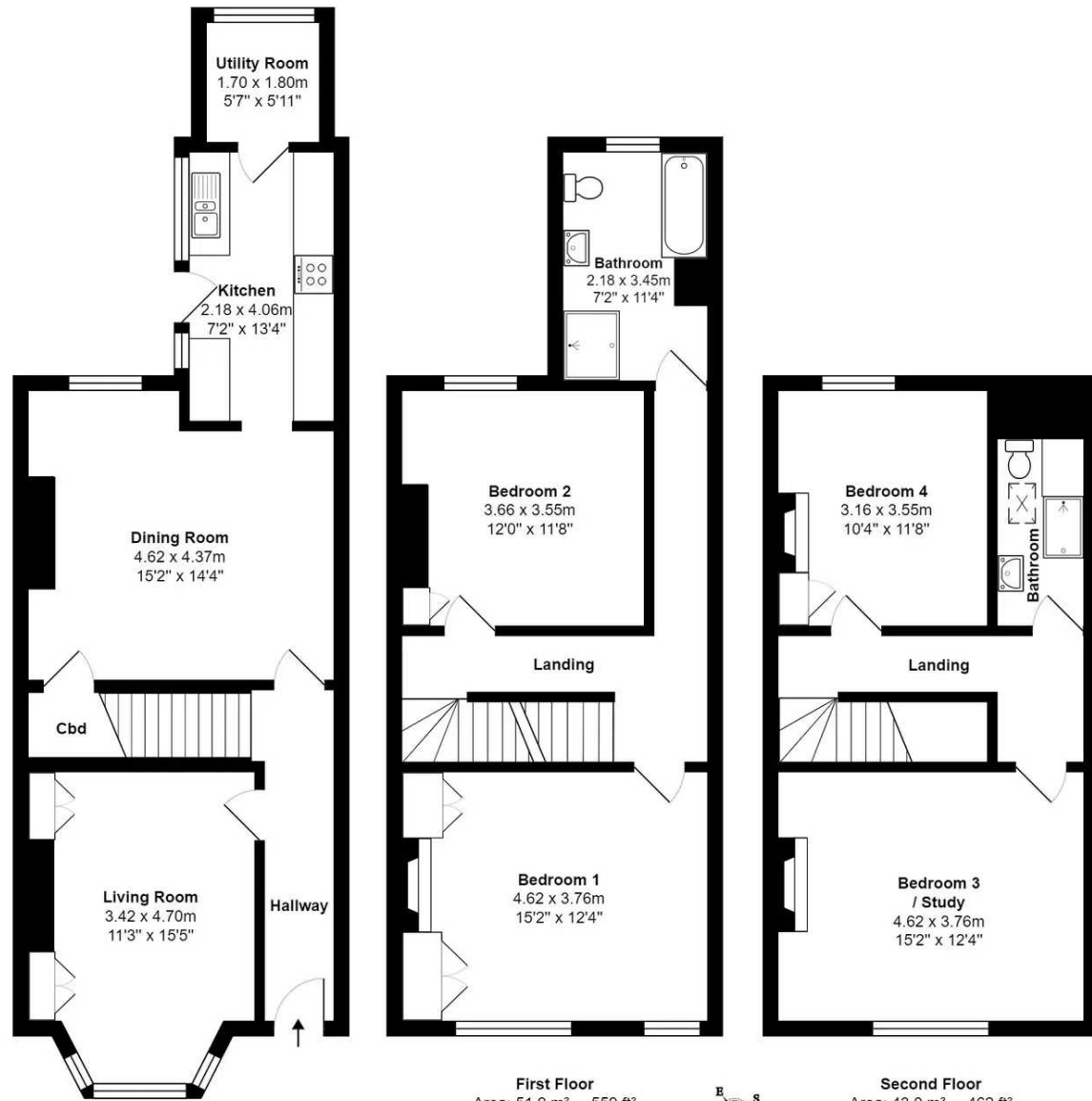
Ground Floor Area: 57.1 m 2 ... 615 ft 2