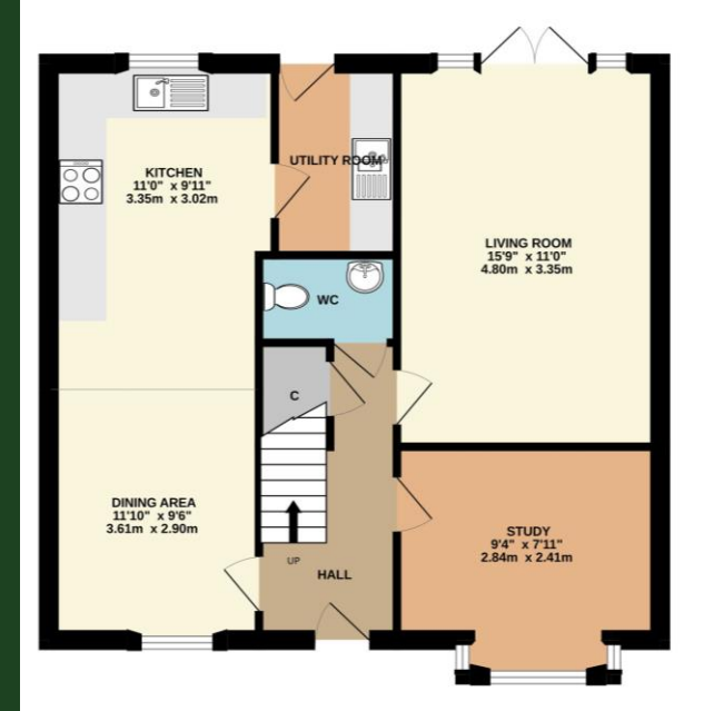
GROUND FLOOR 758 sq.ft. (70.4 sq.m.) approx.