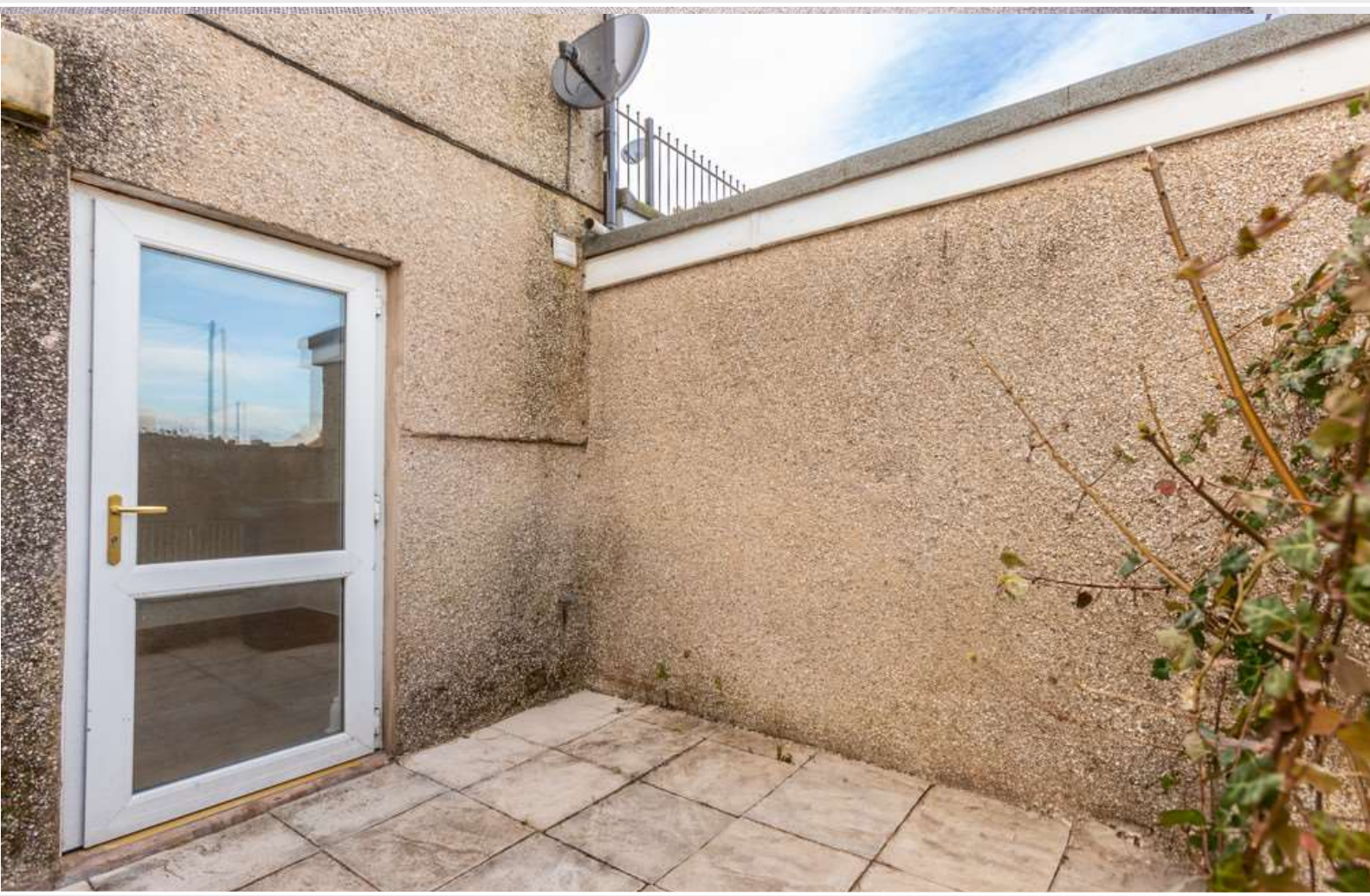
Walled Rear Yard