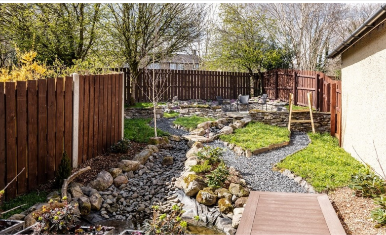
Vendors photo of Lakeland inspired garden