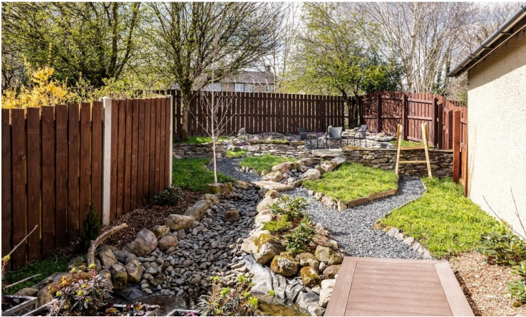
Vendors photo of Lakeland inspired garden