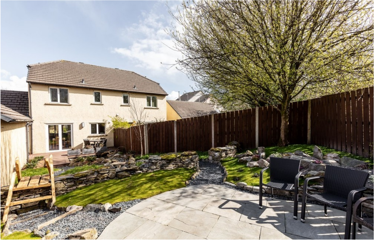
Vendors photo of Lakeland inspired garden