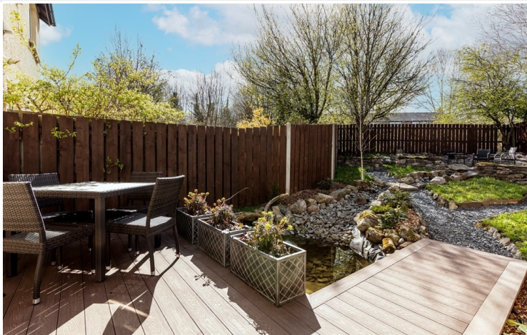
Vendors photo of Lakeland inspired garden

Viewings: Strictly by appointment with Hackney & Leigh Kendal Office.