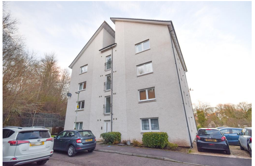
Next Home - 56 Riverside Park, Blairgowrie, PH10 6GB