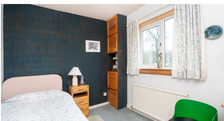
71 Howden Hall Drive