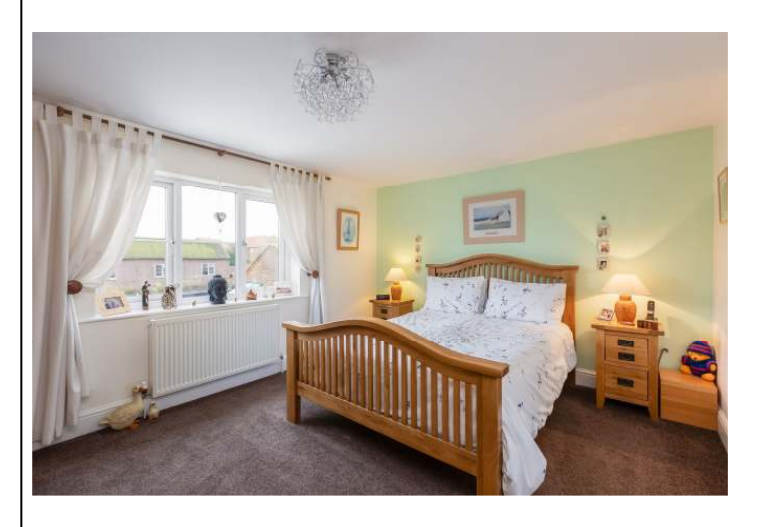
BEDROOM TWO 4.5m x 2.9m (14'9" x 9'6") Casement window to the front. Radiator.