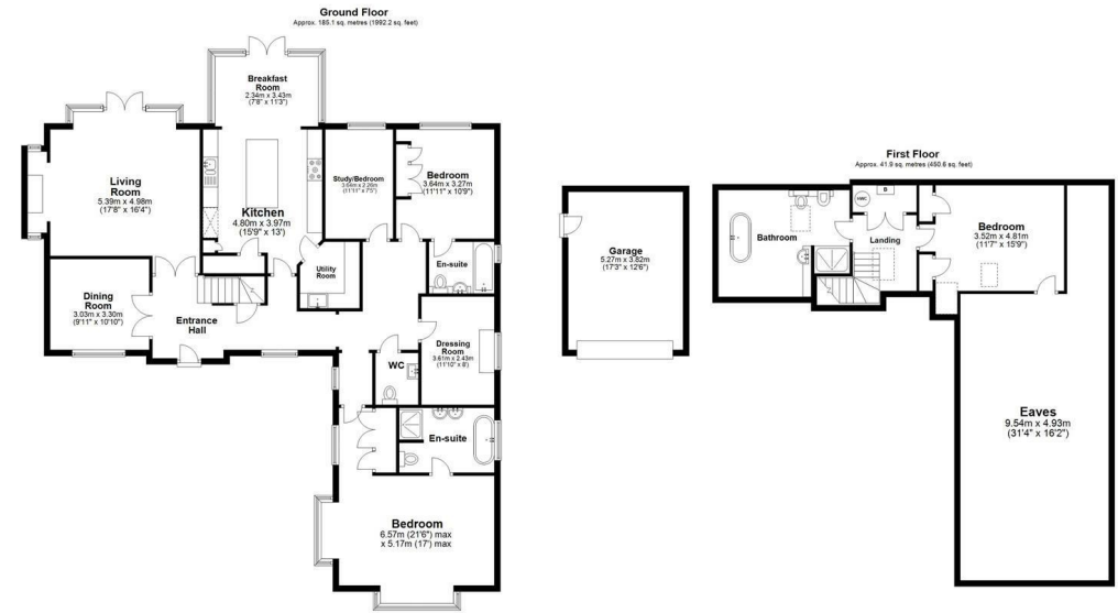
Total area: approx. 226.9 sq. metres (2442.8 sq. feet) Disclaimer: Floor plans for marketing purposes only and to be used as a guide - 50M Studio Plan produced using PlanIt.

These particulars are produced in good faith, are set out as a general guide only and do not constitute any part of a contract. None of the statements are to be relied on as a statement of fact. Areas, measurements or distances are given as a guide only. We have not tested any of the equipment, appliances or services to this property nor do we have knowledge of any defects.