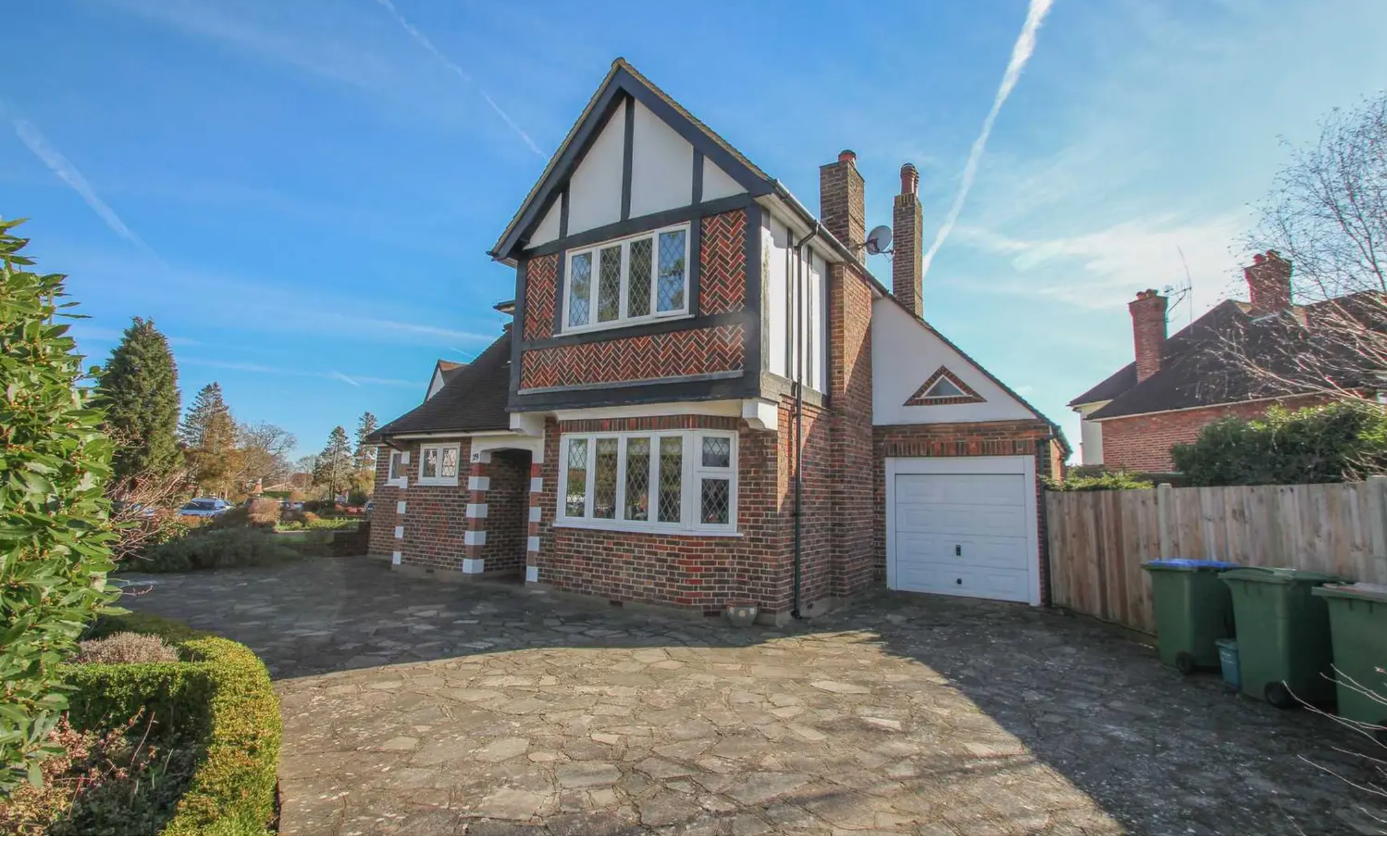
29 Cumberland Drive, Esher £3,100 pcm