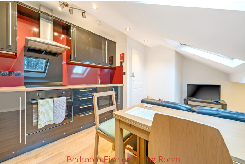
Bedroom Five or Sitting Room