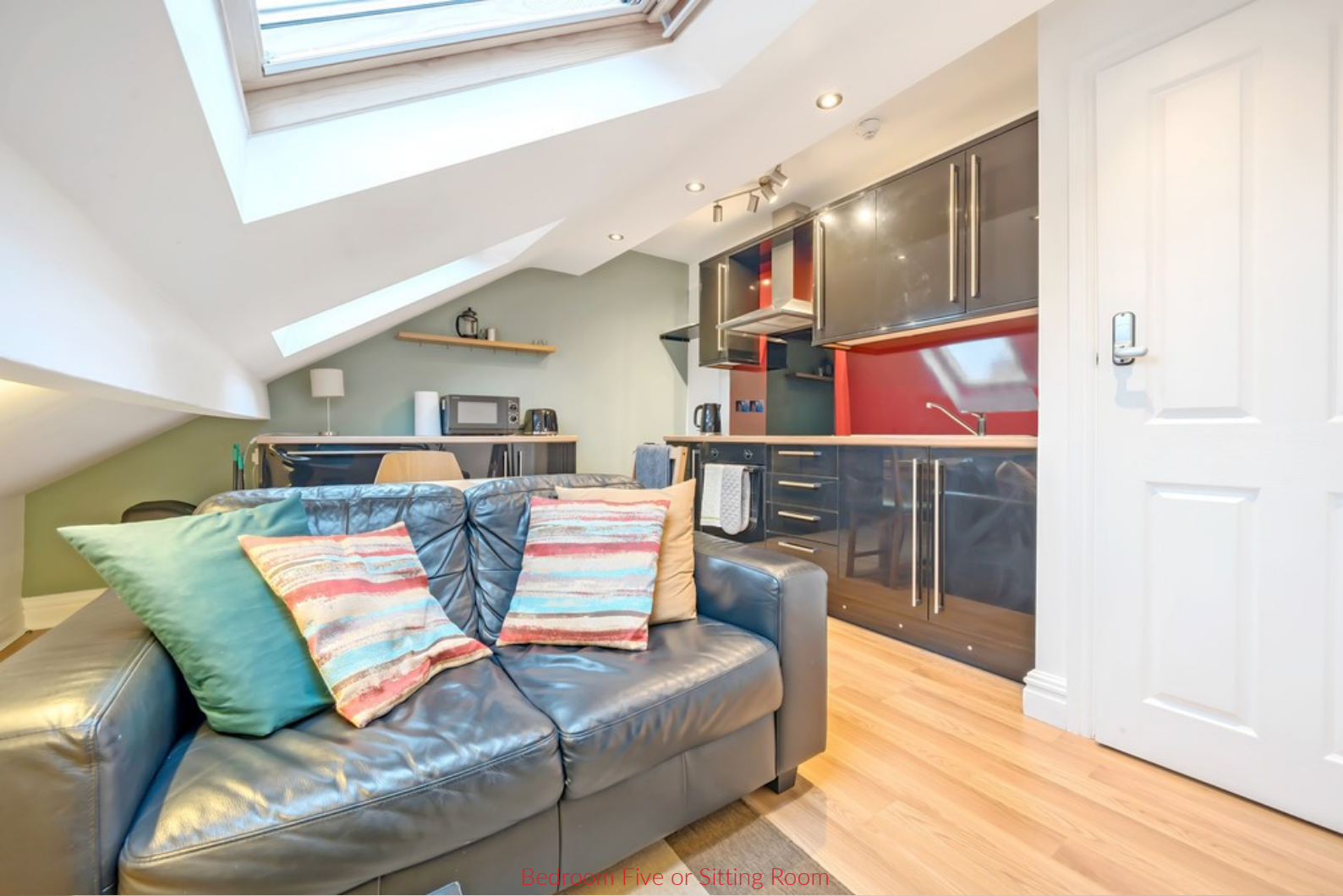
Bedroom Five or Sitting Room