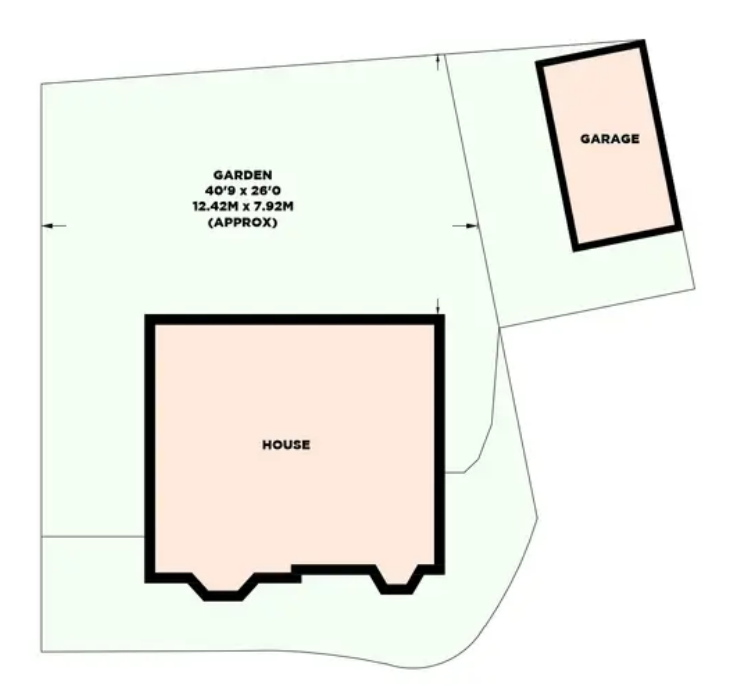
Ground Floor 696 sq Ft / 64.7 sq M