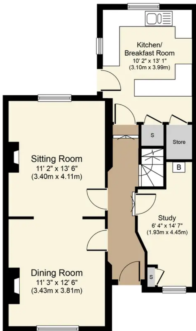
Ground Floor Approximate Floor Area 628 sq. ft. (58.3 sq. m.)