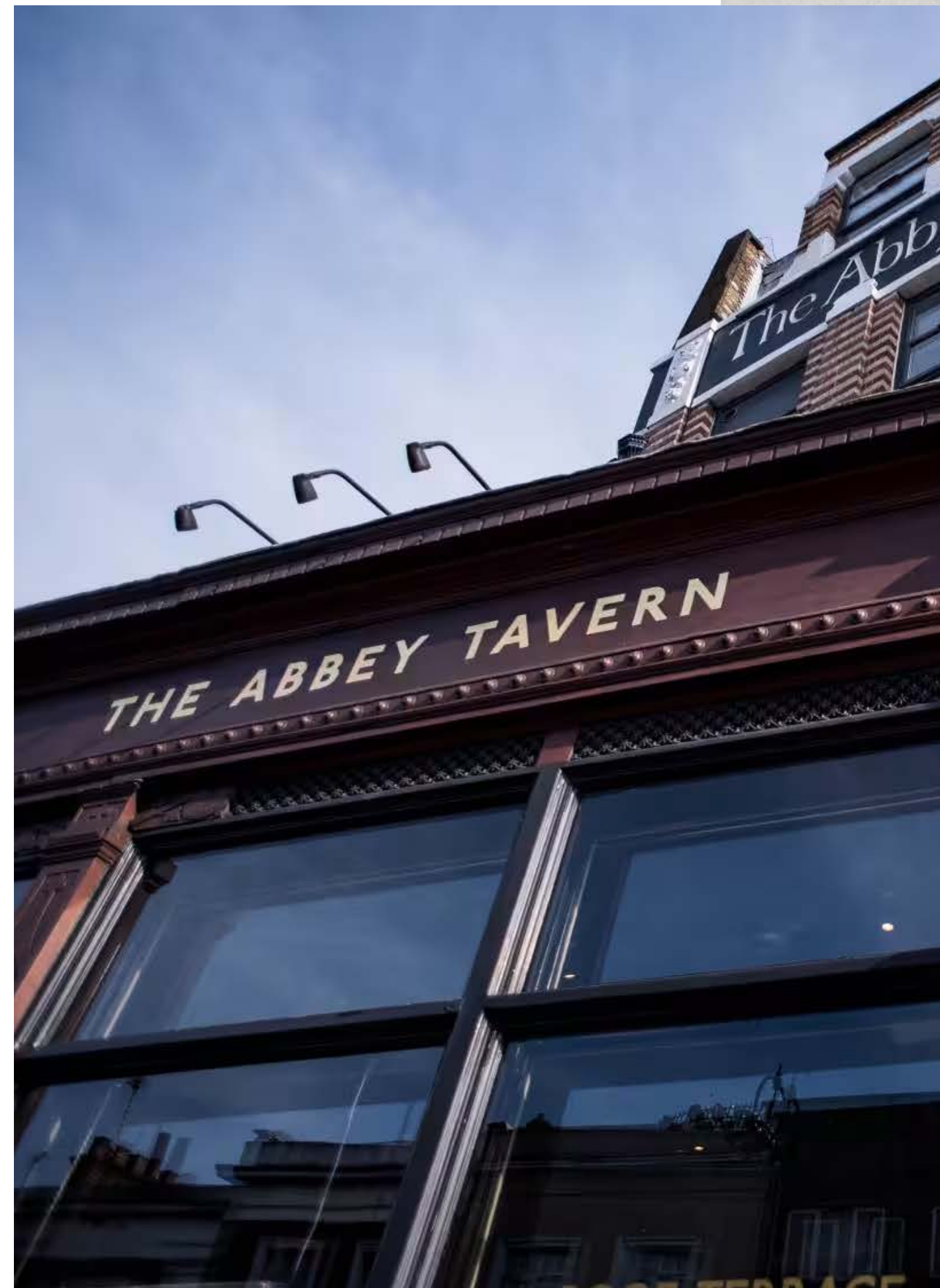
The Abbey Tavern