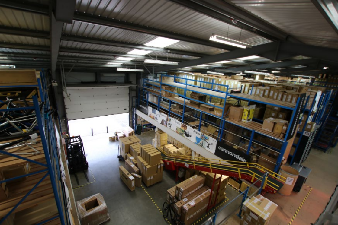
D12, The Fulcrum | Vantage Way | Poole | Dorset | BH12 4NU