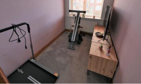
Fairfield Road | Ipswich | IP3 9LB