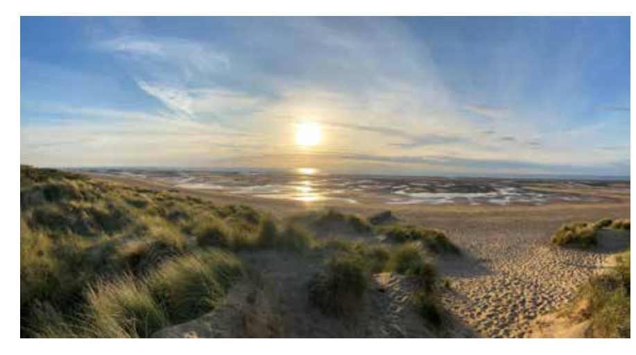
Old Hunstanton Beach