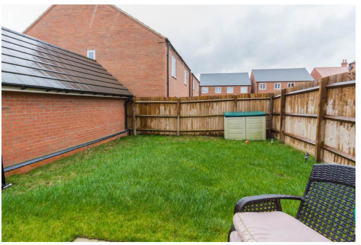
Sapphire Street Irthlingborough NN9 5GX Freehold Price £275,000

Wellingborough Office 27 Sheep Street Wellingborough Northants NN8 1BS 01933 224400