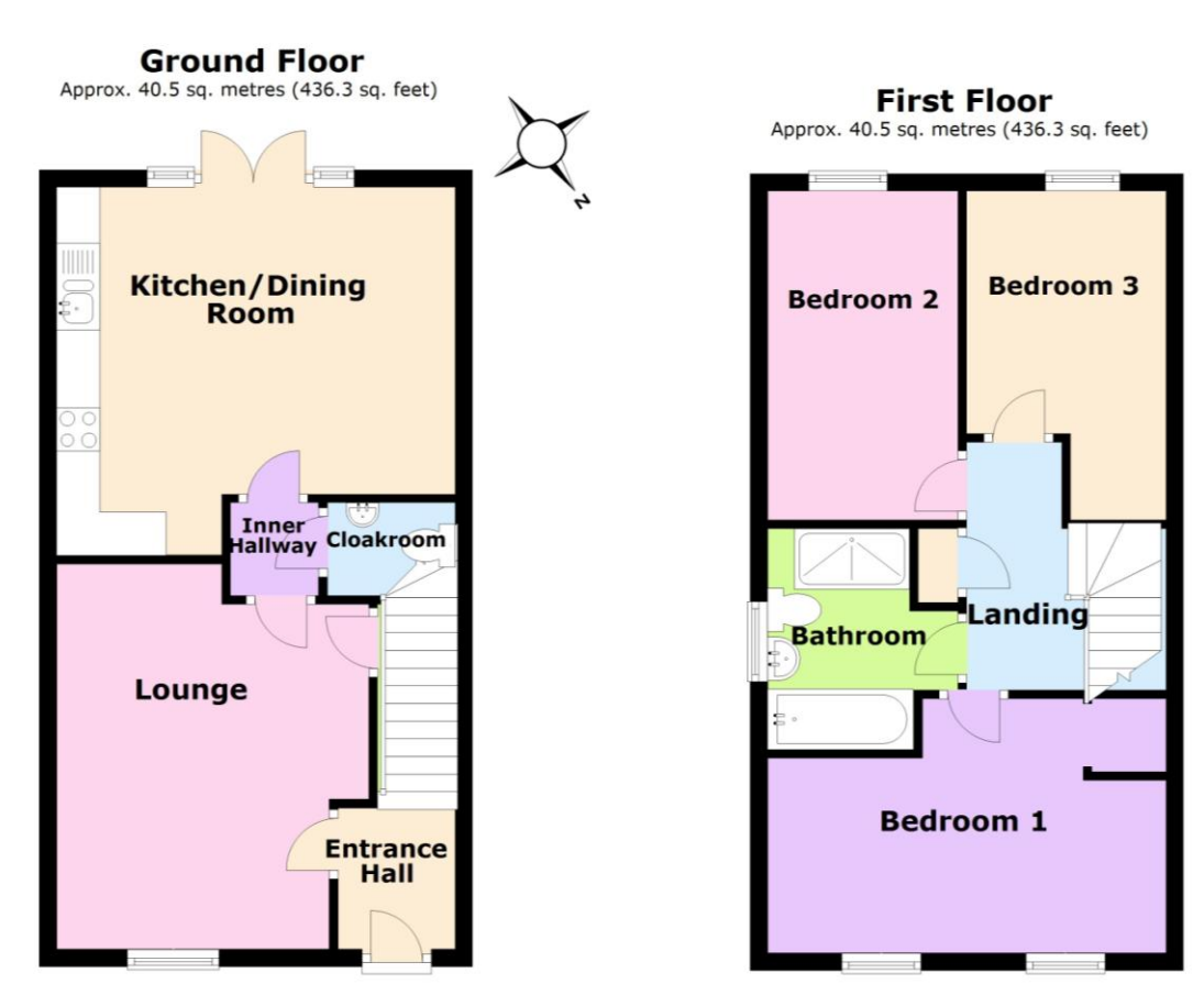
Total area: approx. 81.1 sq. metres (872.7 sq. feet)