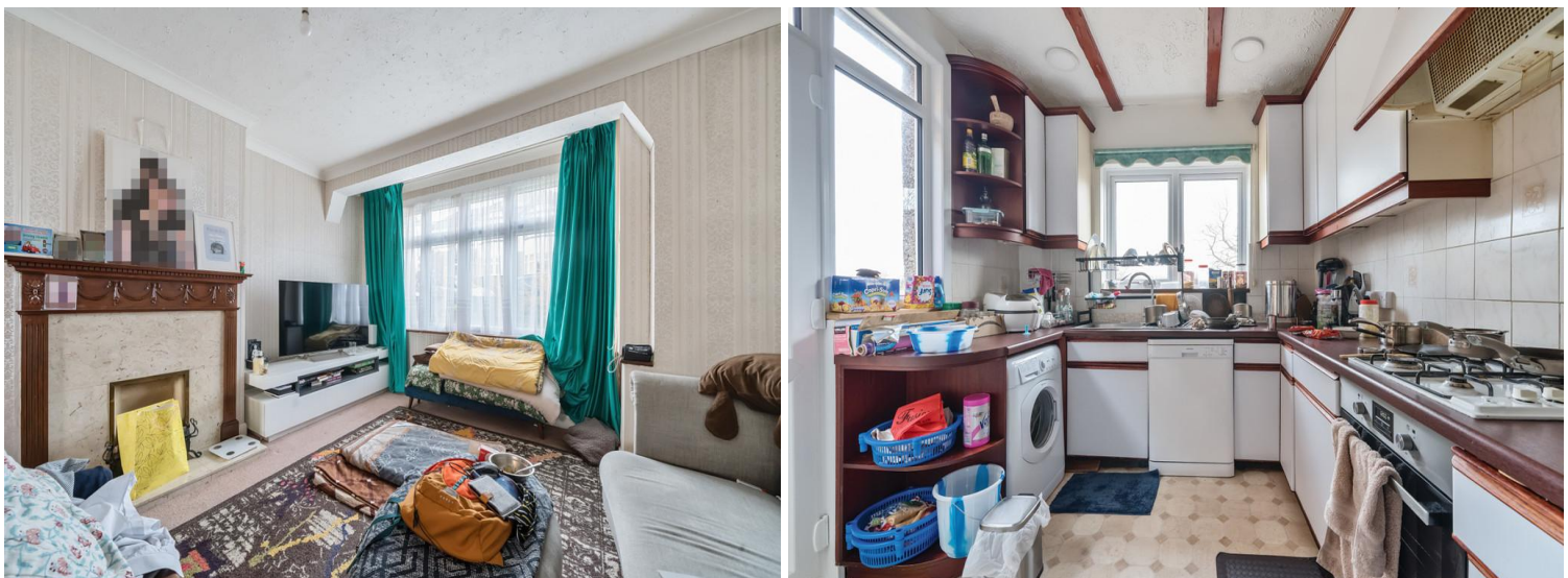
5 Prior Avenue, Sutton, SM2 5HX | Guide Price £650,000 Freehold

A superb 3 bedroom semi-detached house ideally located on a highly sought-after road between South Sutton and Carshalton Beeches. Set in the highly popular South Sutton area, this enchanting semi-detached family home offers an unmissable opportunity. Featuring three generously sized double bedrooms, this property provides ample space for comfortable family living.