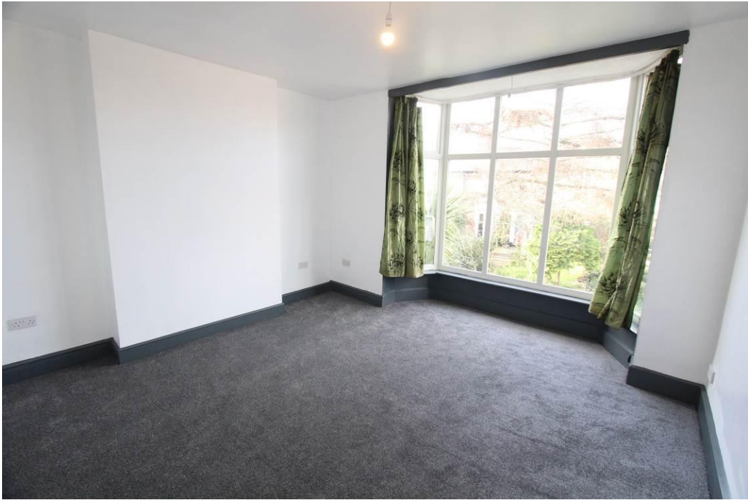
BEDROOM 2: 13' 5" x 12' 3" (4.09m x 3.73m) Panelled radiator. Coved ceiling. Window to rear elevation.