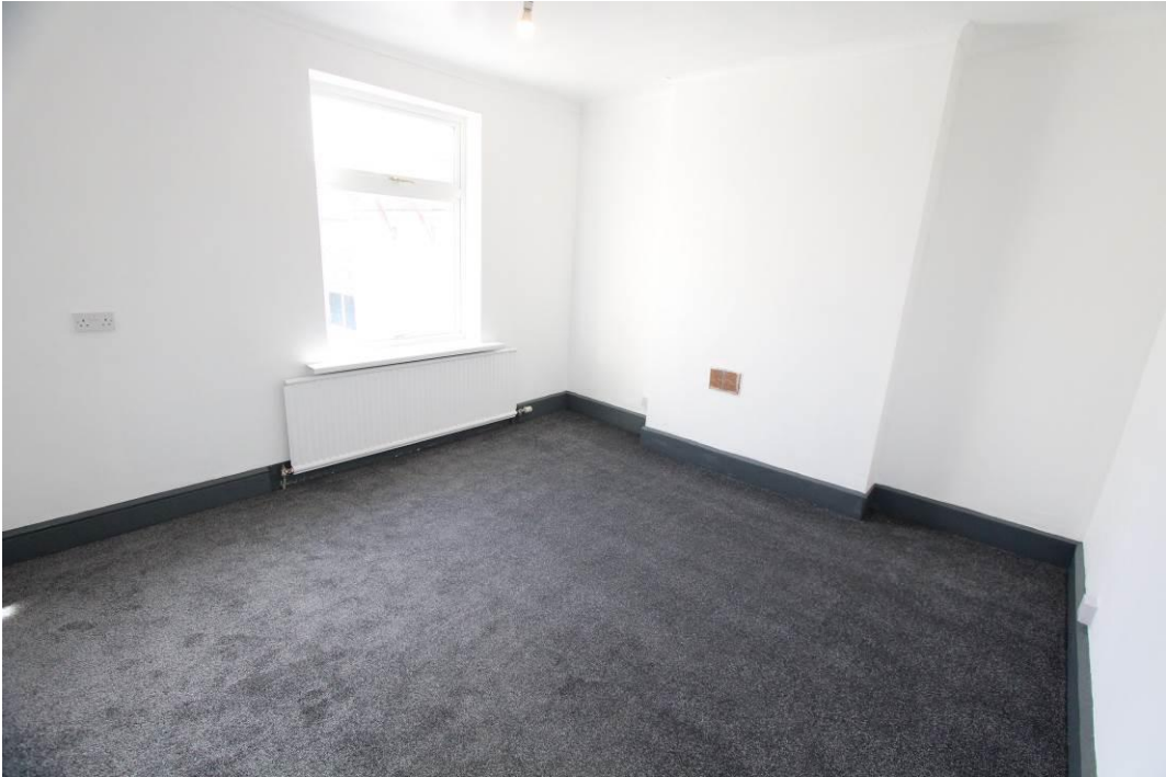
BEDROOM 4: 8' 8" x 6' 7" (2.64m x 2.01m) Panelled radiator. Window to front elevation.