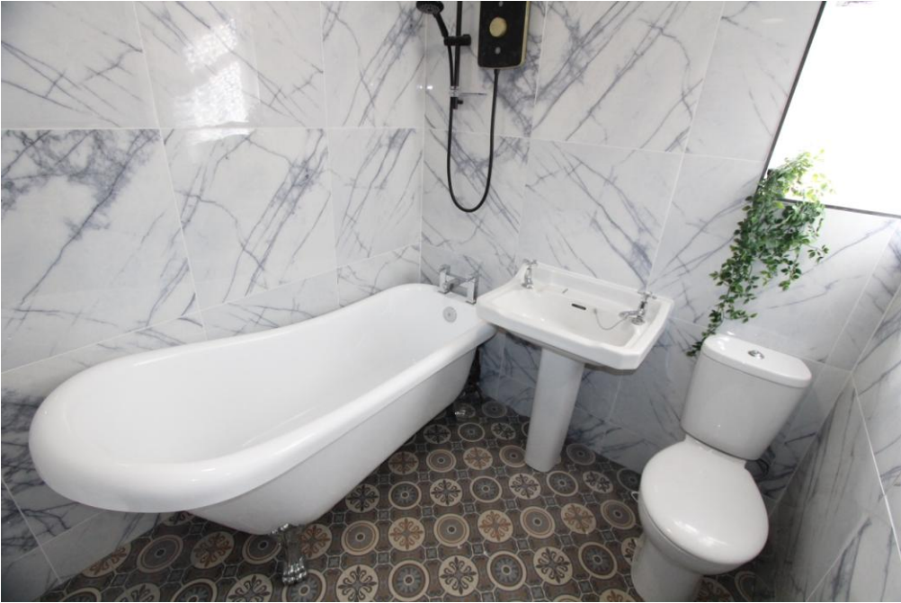
SHOWER ROOM 1: Towel rail Fitted 3 piece suite comprising wc, wash hand basin and shower enclosure with fitted shower. Marble tiled walls.