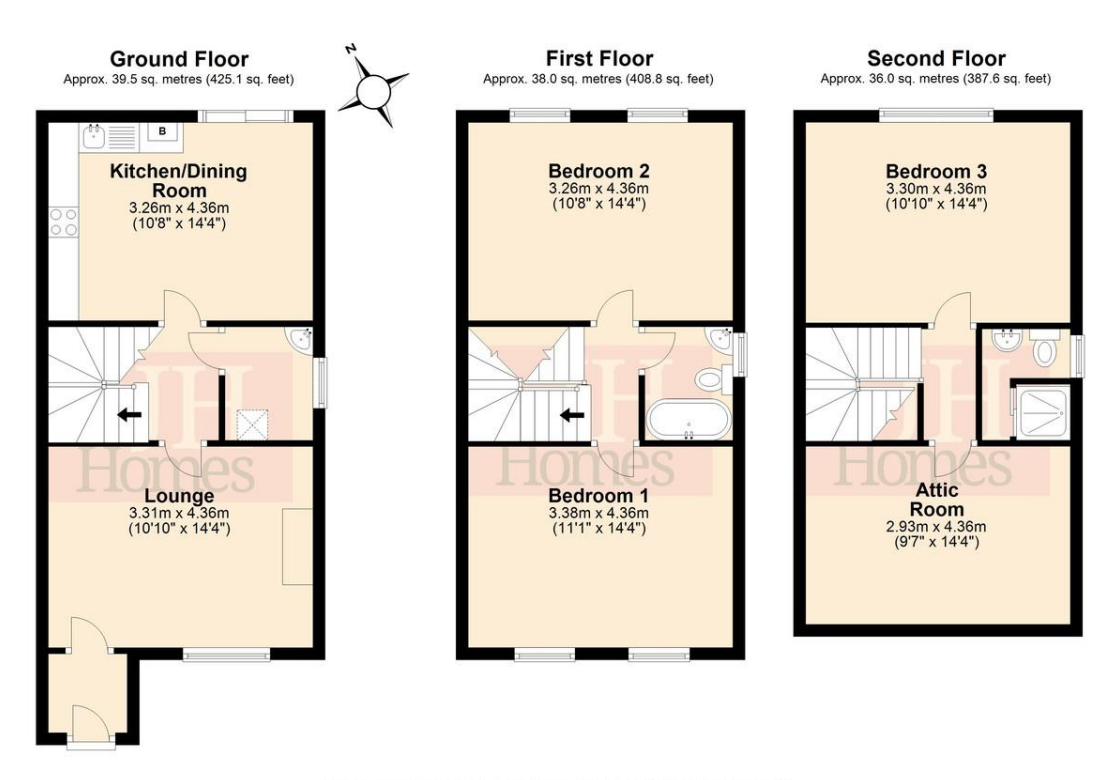
Total area: approx. 113.5 sq. metres (1221.5 sq. feet)