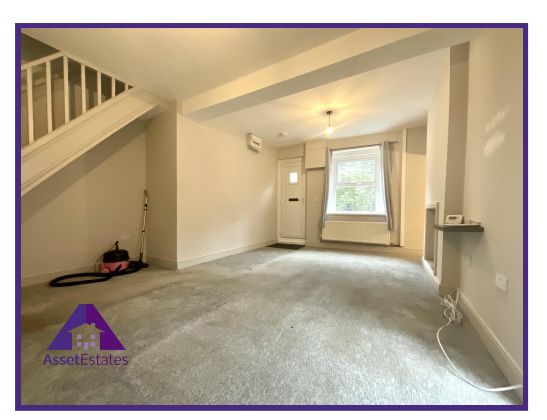
Rhiw Parc Road, Abertillery, NP13 1BS