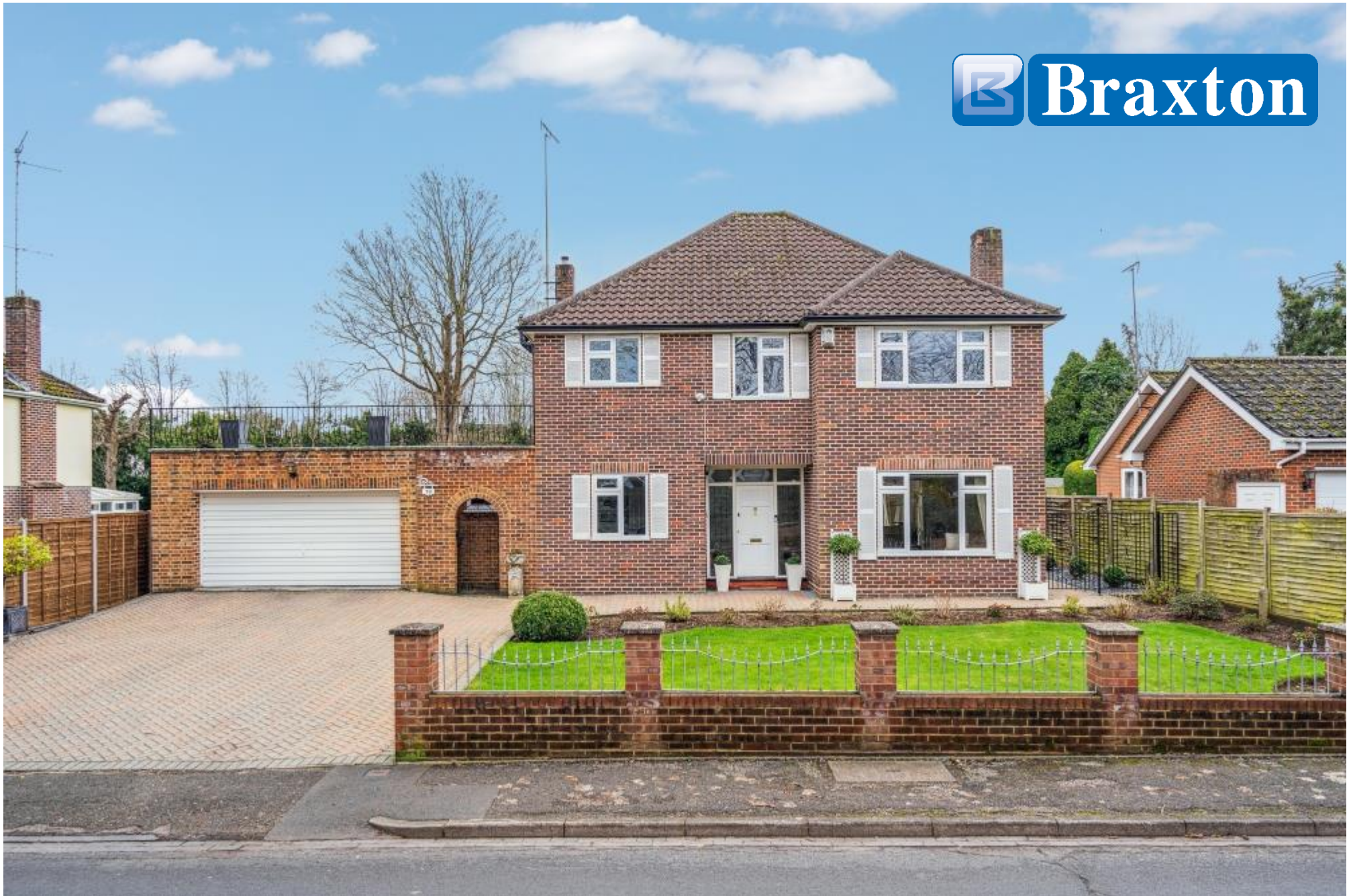
76 Sheephouse Road, Maidenhead, Berkshire SL6 8HP