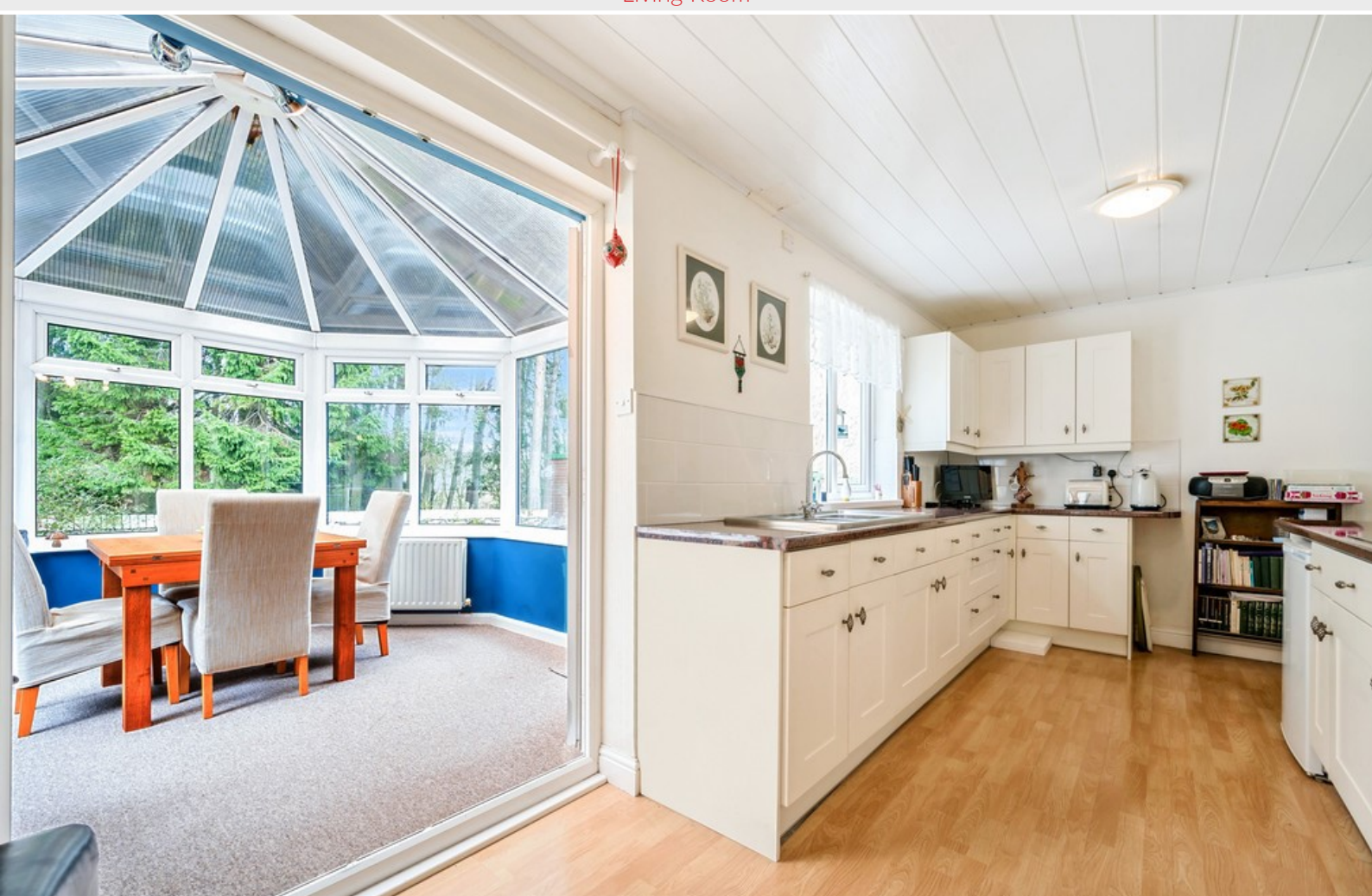
Kitchen and Conservatory