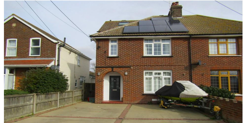
Thorpe Road Kirby Cross, Frinton-on-Sea

Rent: £1,750 pcm Energy Efficiency Rating B