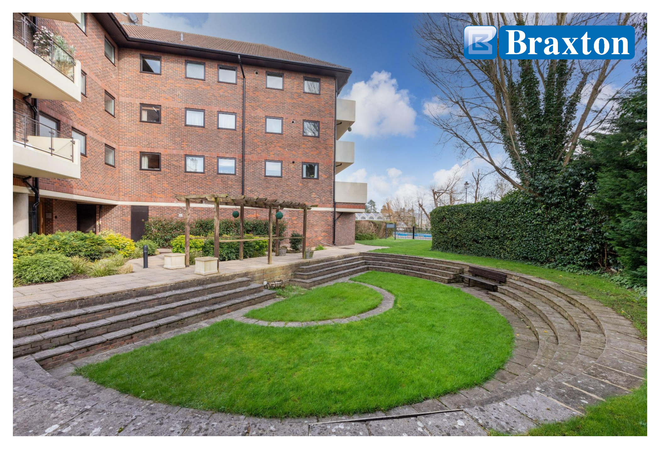
2 Lockbridge Court, Maidenhead, Berkshire, SL6 8UP