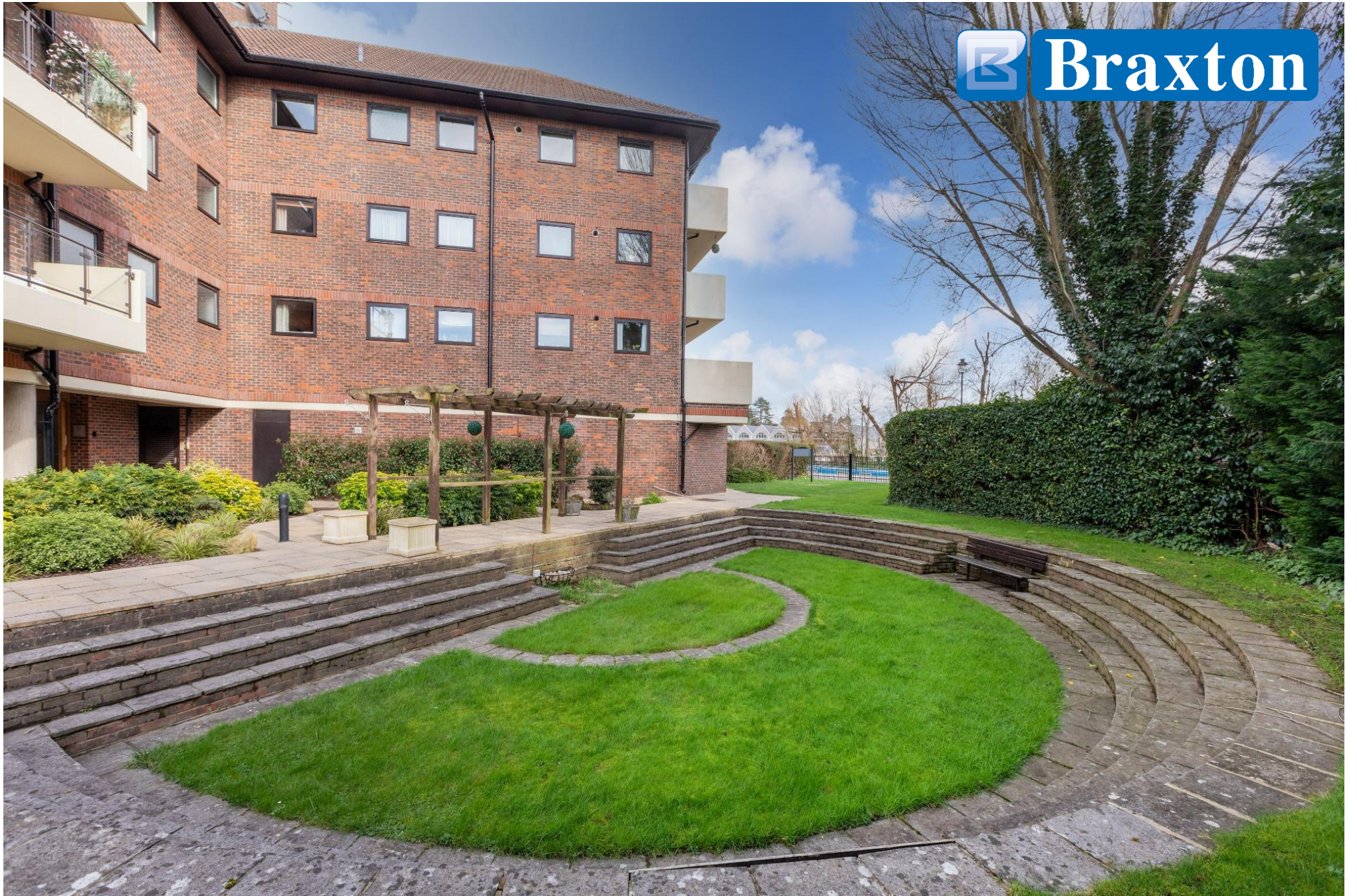
2 Lockbridge Court, Maidenhead, Berkshire, SL6 8UP