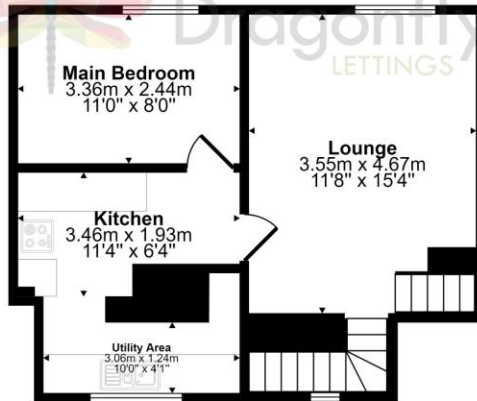
First Floor Approx 40 sq m / 433 sq ft

This floorplan is only for illustrative purposes and is not to scale. Measurements of rooms, doors, windows, and any items are approximate and no responsibility is taken for any error, omission or mis-statement. Icons of items such as bathroom suites are representations only and may not look like the real items. Made with Made Snappy 360.