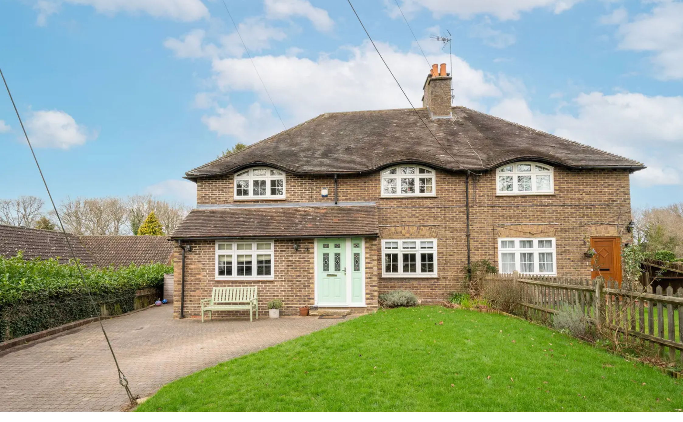
1 Golf Cottages Greens Lane Golding Lane, Mannings Heath Guide Price £795,000