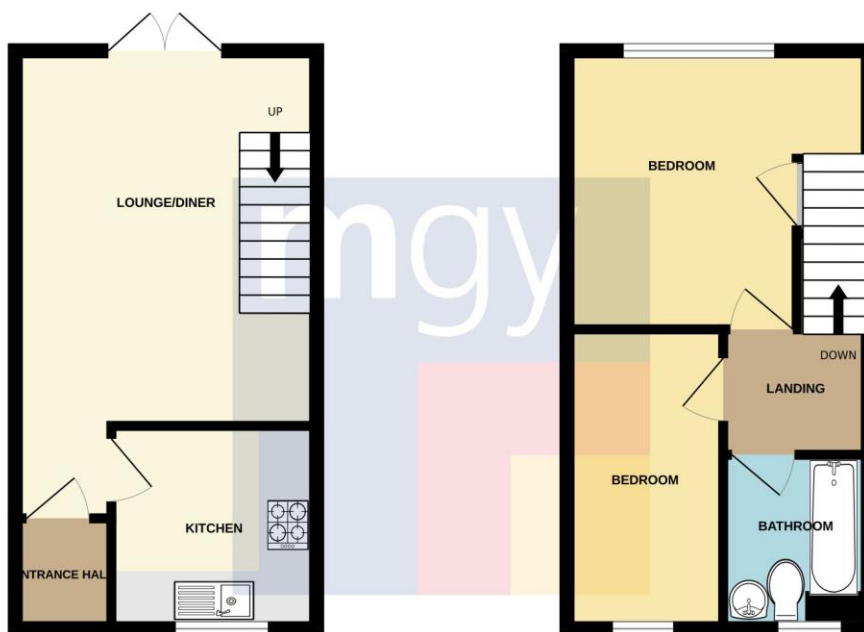
TOTAL FLOOR AREA : 534 sq.ft. (49.6 sq.m.) approx.

Whilst every attempt has been made to ensure the accuracy of the floorplan contained here, measurements of doors, windows, rooms and any other items are approximate and no responsibility is taken for any error, omission or mis-statement. This plan is for illustrative purposes only and should be used as such by any prospective purchaser. The services, systems and appliances shown have not been tested and no guarantee as to their operability or efficiency can be given. Made with Metroplan ©2024