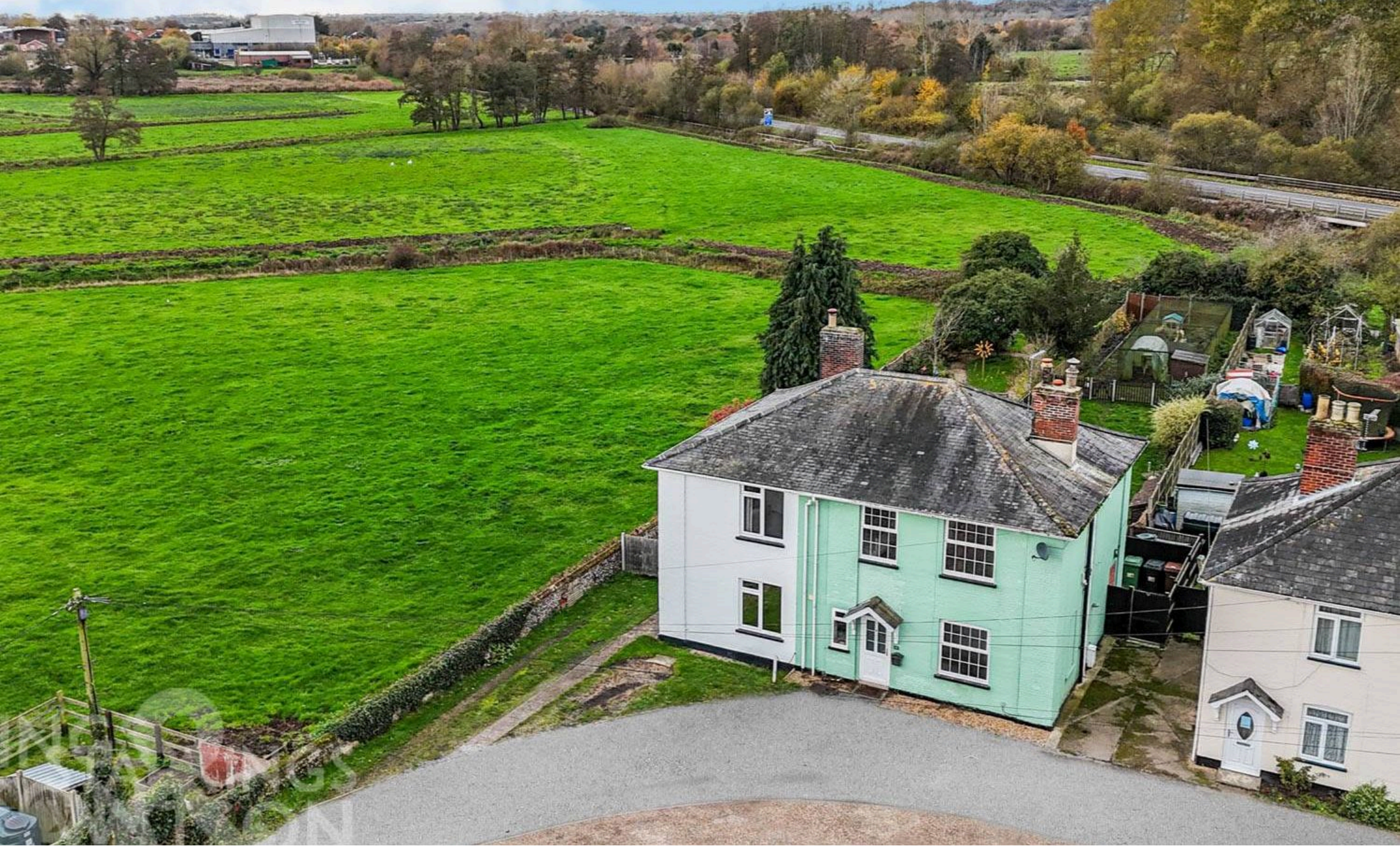
Ditchingham Dam, Ditchingham - NR35 2JH