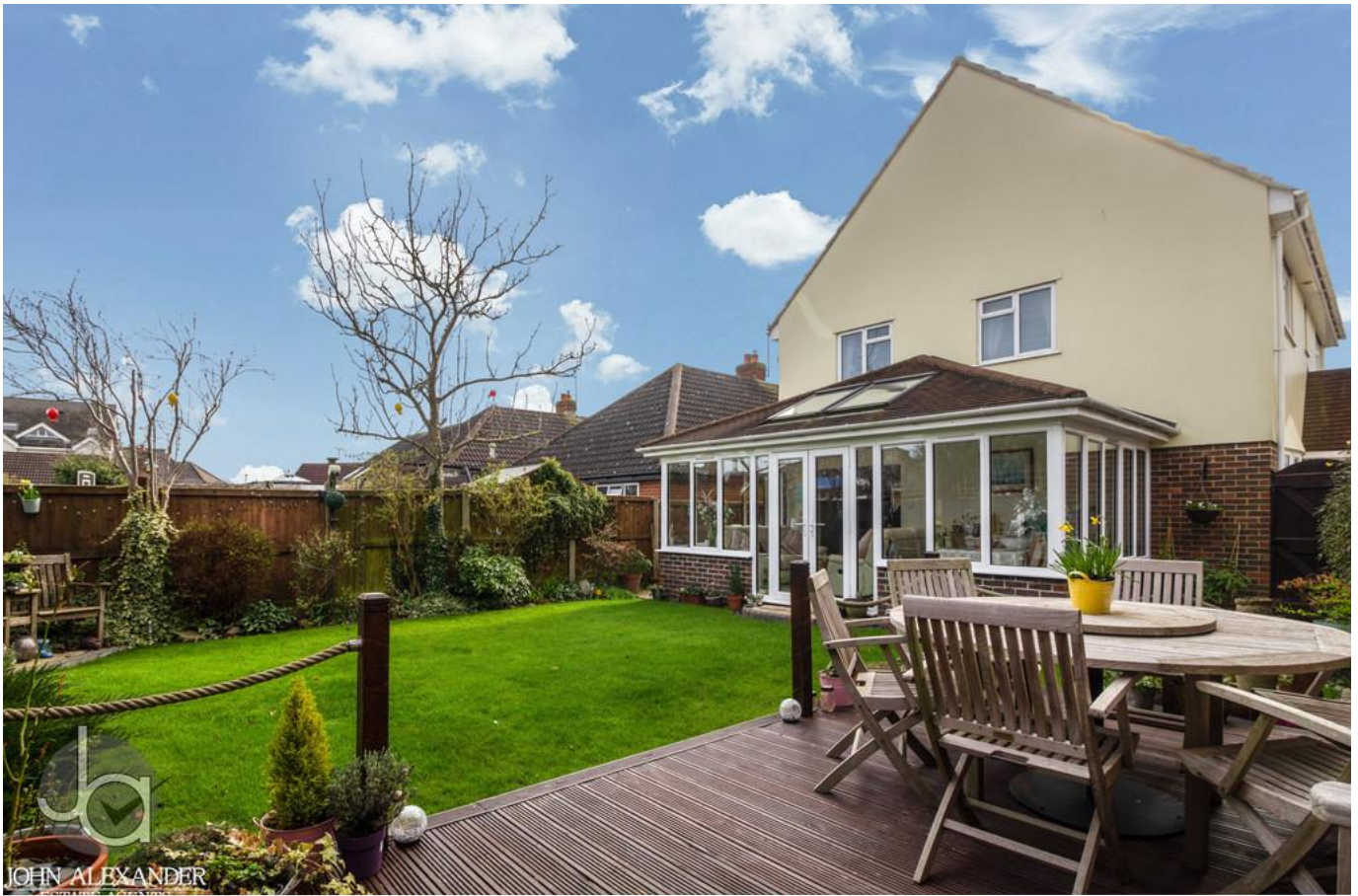
Rosemary Crescent, Tiptree CO5 0XA