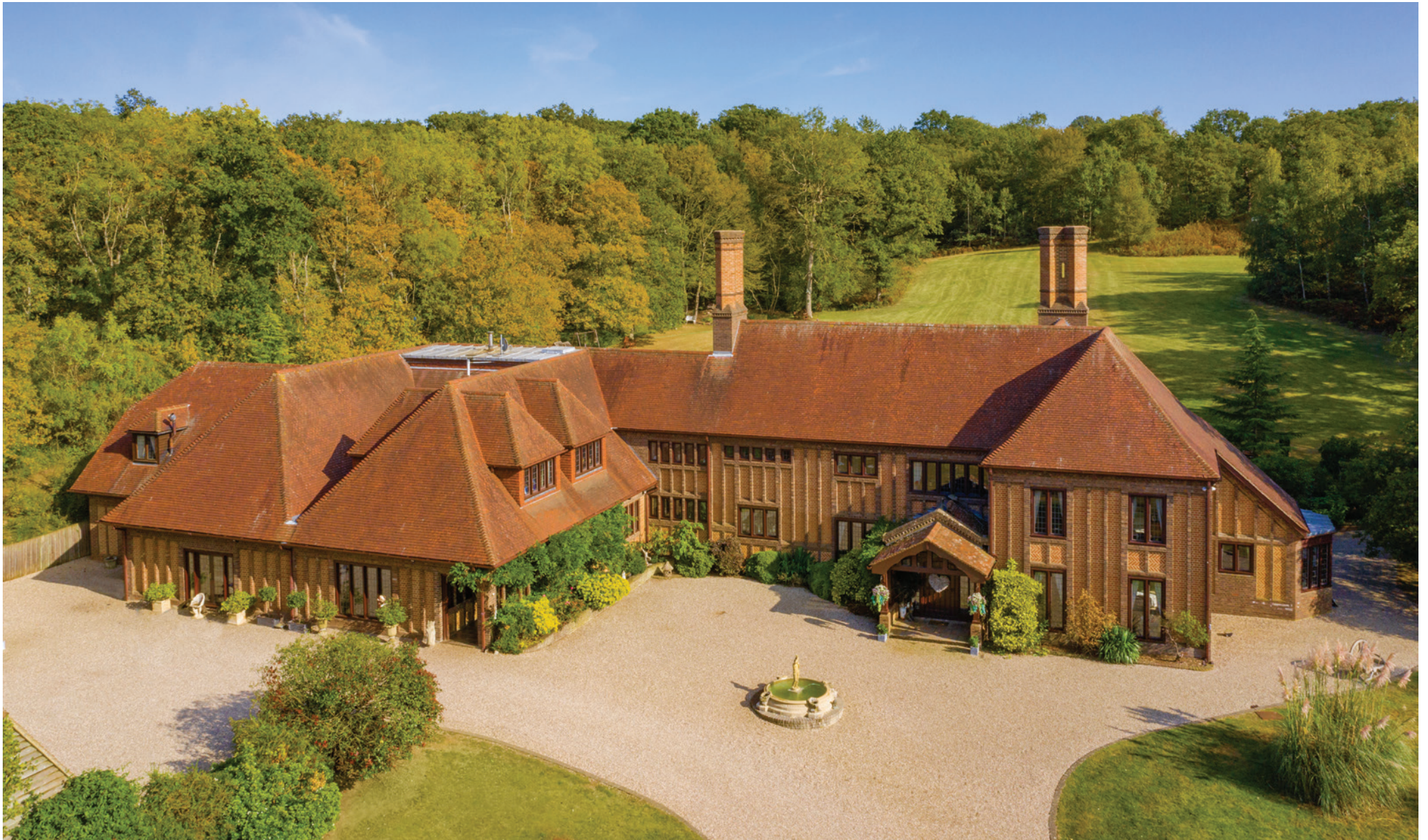
Fernbrook Hall Mope Lane | Wickham Bishops | CM8 3JP