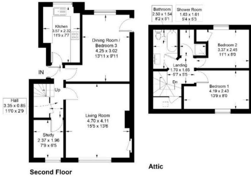
Illustration for identification purposes only, measurements are approximate, not to scale. floorplans.uk/sketch.com © (ID1053245)

Approximate Gross Internal Area = 83.9 sq m / 903 sq ft