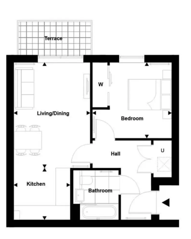
Green Park Village, The Longwater Collection - Property 378, Ground Floor