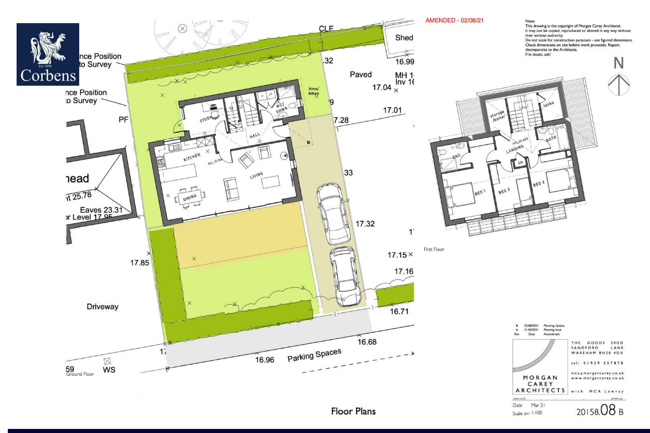
PLOT, 2a BATTLEMEAD, SWANAGE Guide £250,000 - For Sale by Tender, Closing Friday 26 April