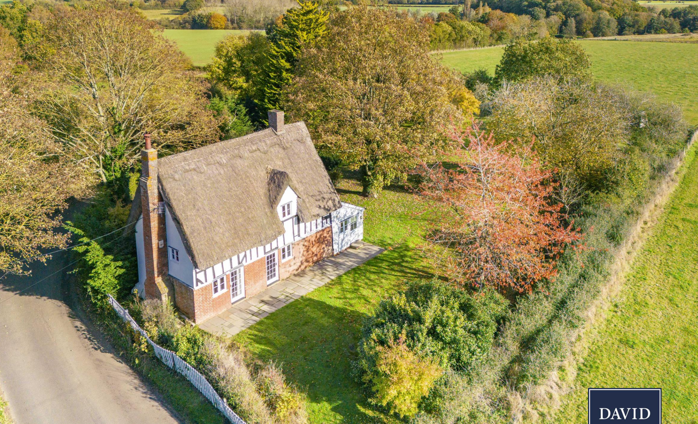
Thatched Cottage Dorking Tye, Bures