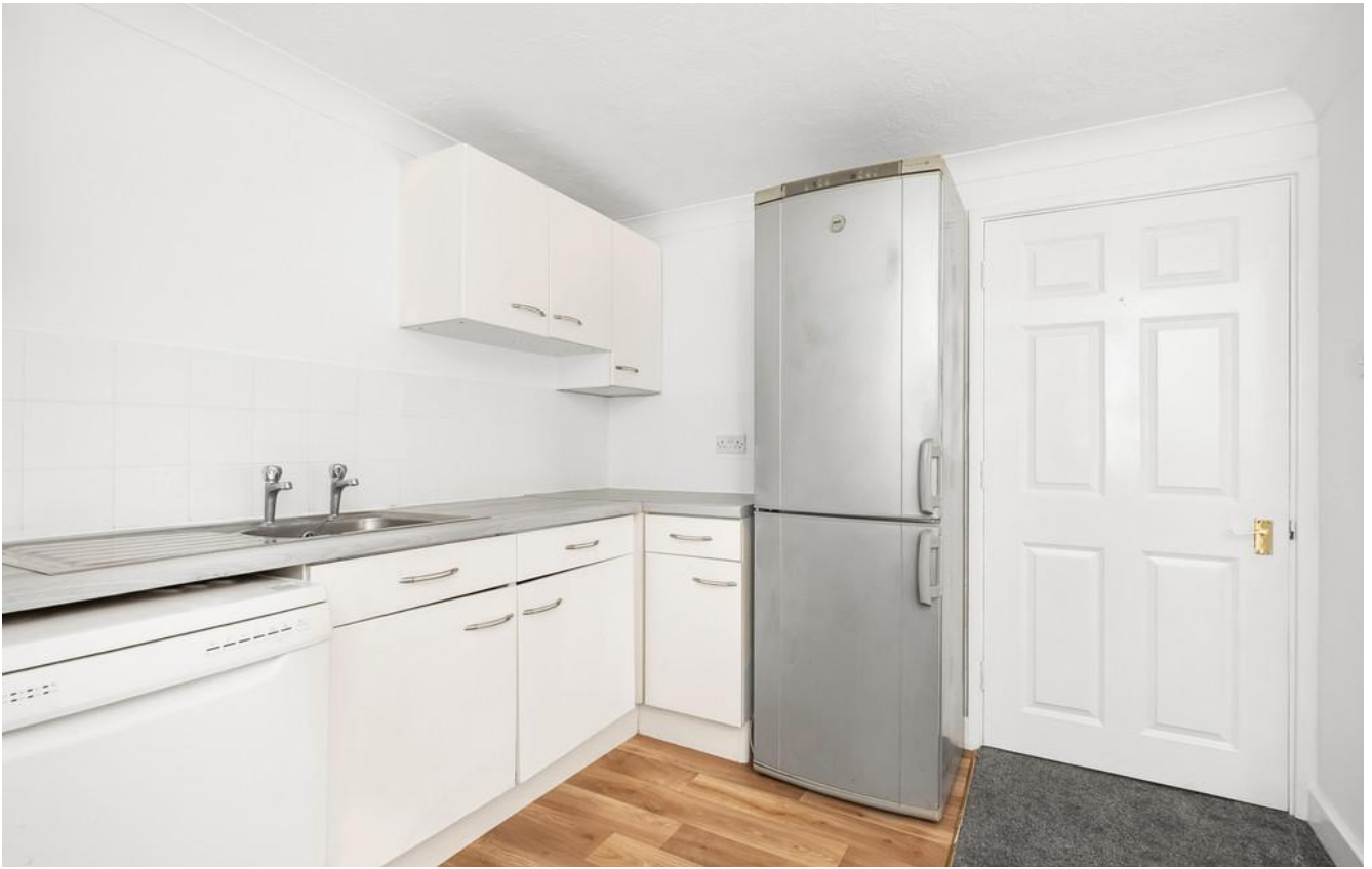
Martin & Co Croydon now!