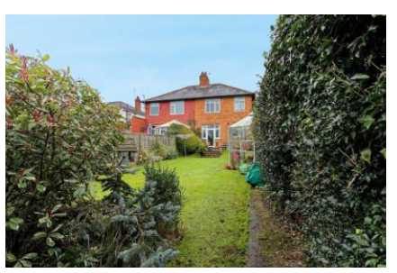
EPC To Follow