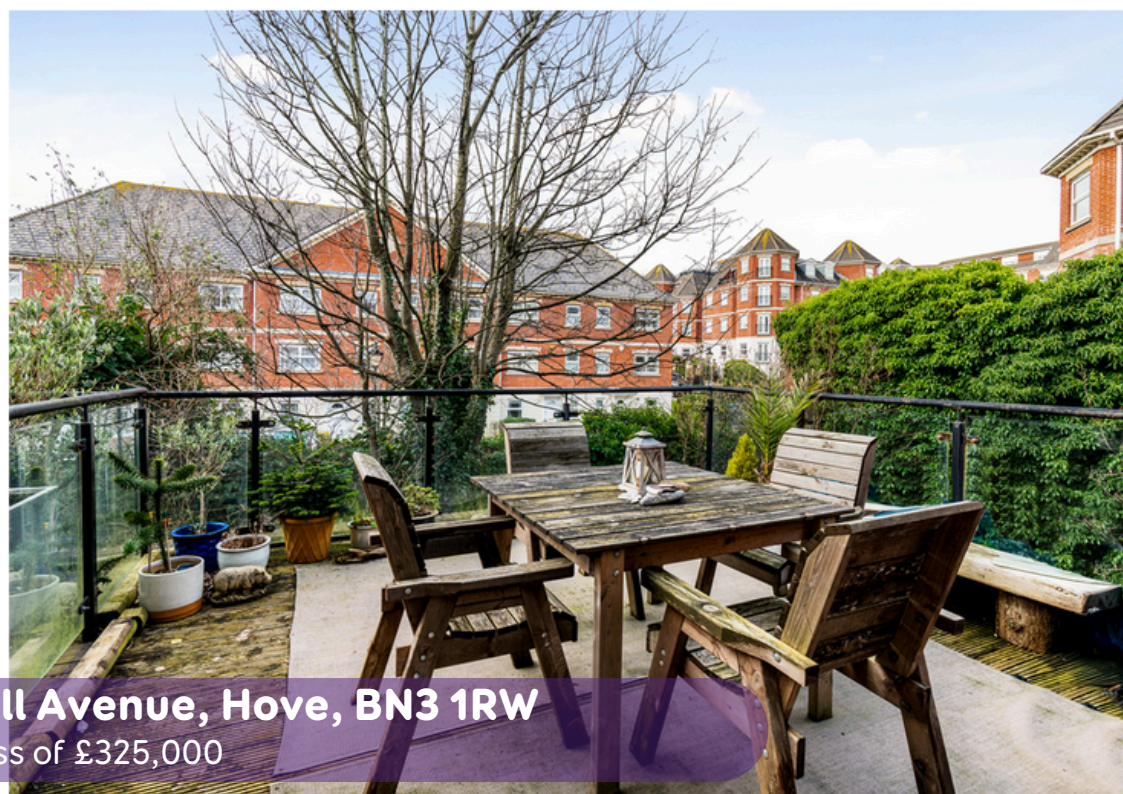
Southdown House, Somerhill Avenue, Hove, BN3 1RW Offers In Excess of £325,000