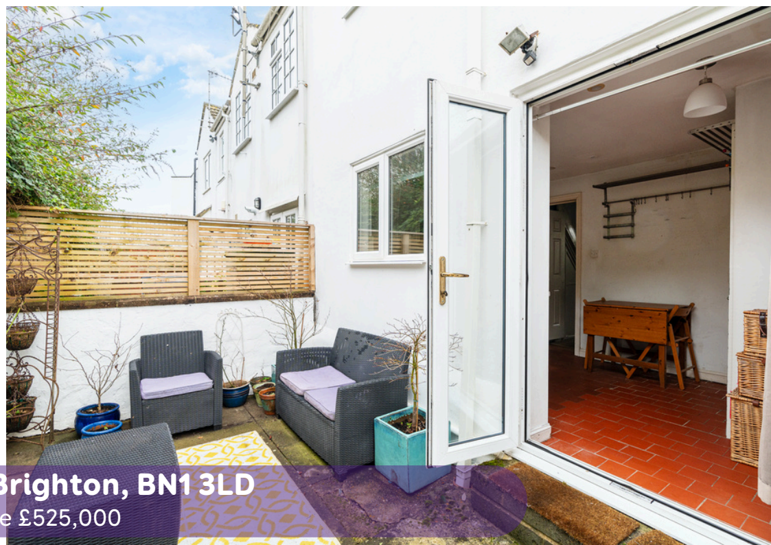
Crown Gardens, Brighton, BN1 3LD Asking Price £525,000