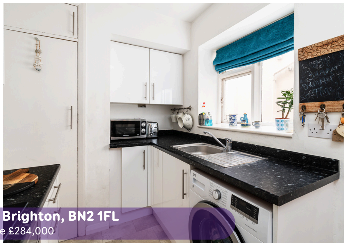
Chichester Close, Brighton, BN2 1FL Asking Price £284,000