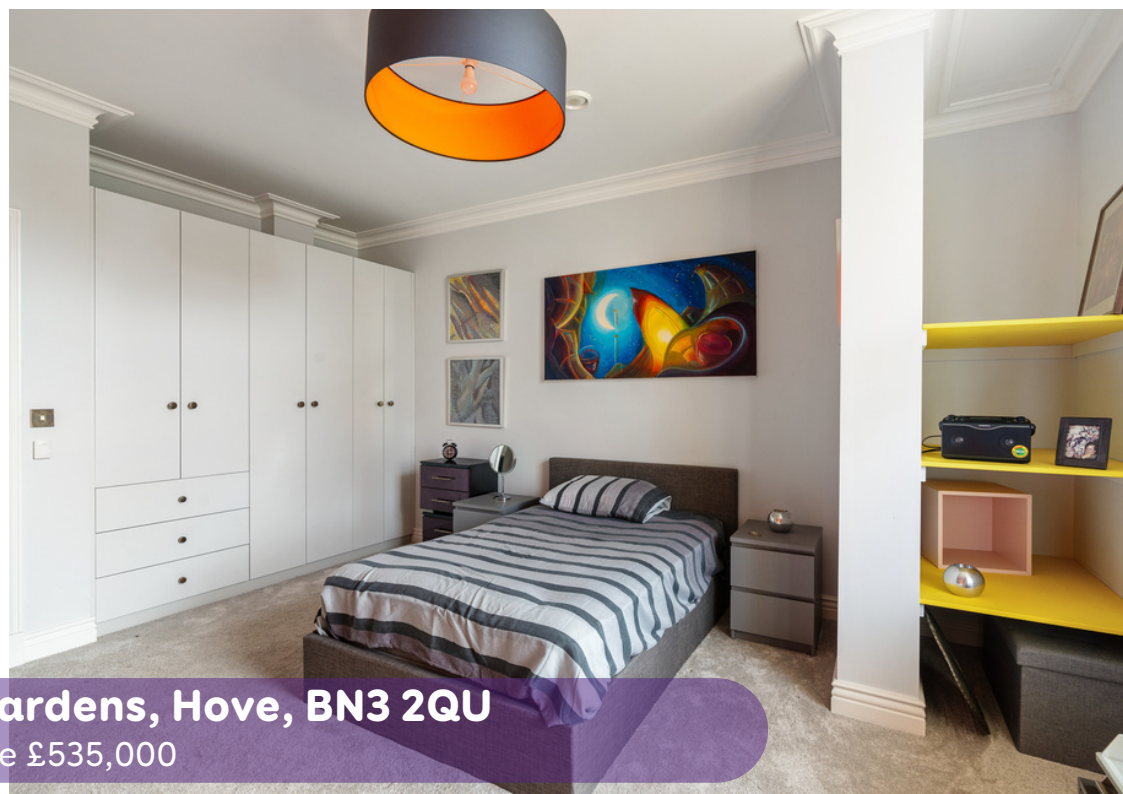
Kings House, Queens Gardens, Hove, BN3 2QU Asking Price £535,000