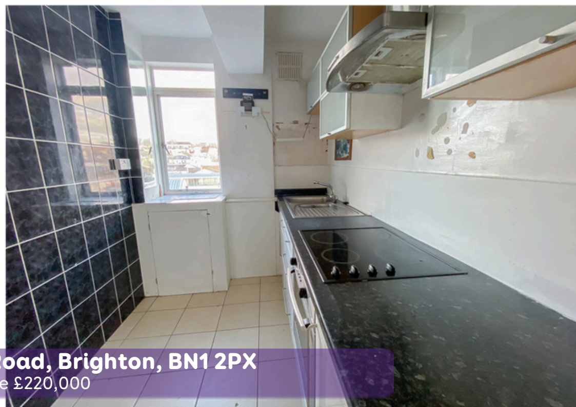
Embassy Court, Kings Road, Brighton, BN1 2PX Asking Price £220,000