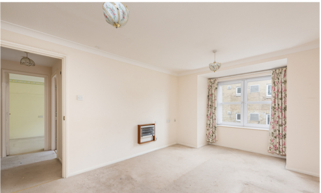
College Court, Brighton, BN2 0BF Asking Price £170,000