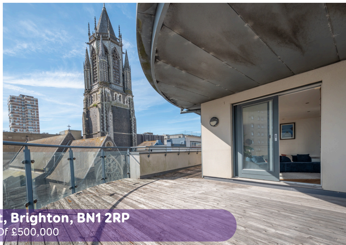
Avalon, West Street, Brighton, BN1 2RP Asking Price Of £500,000