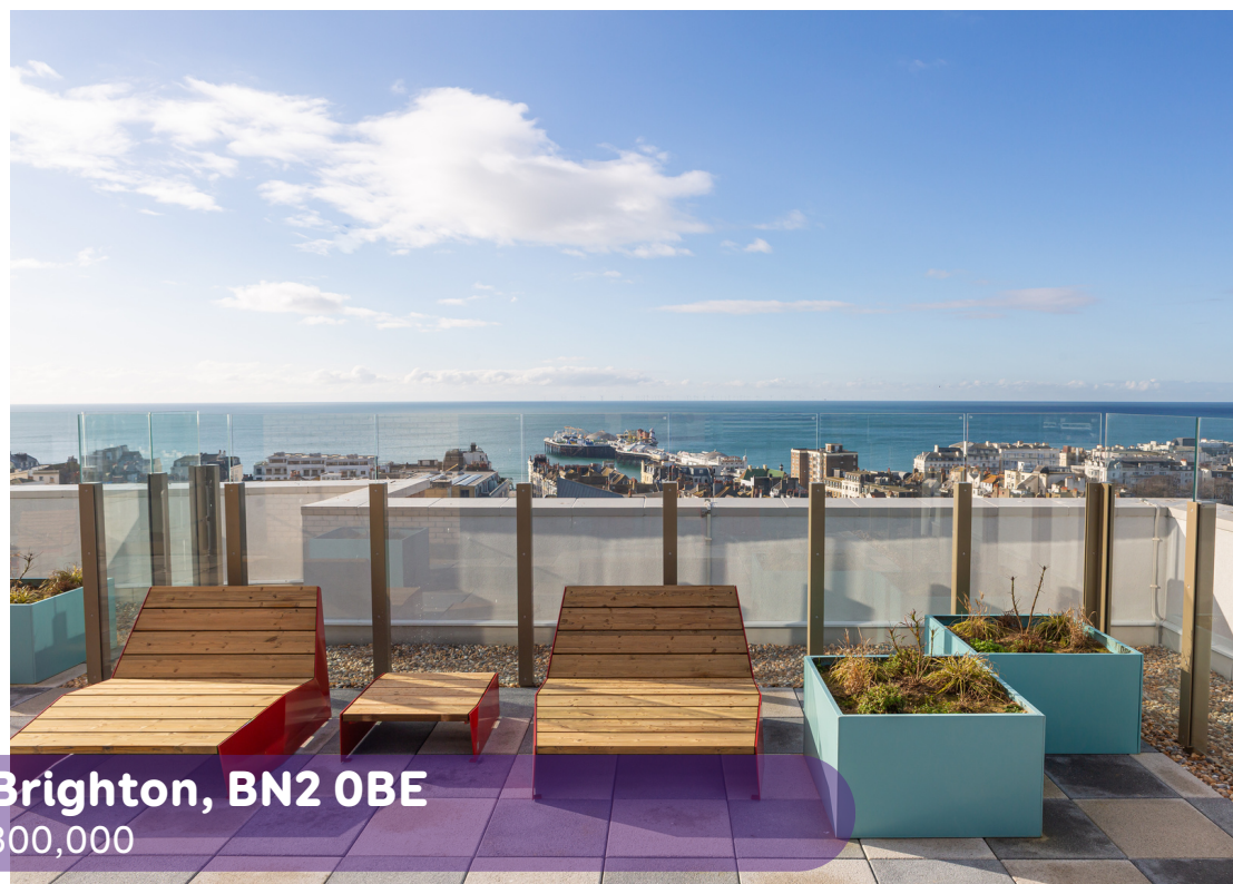
37 Edward Street, Brighton, BN2 0BE Price £300,000